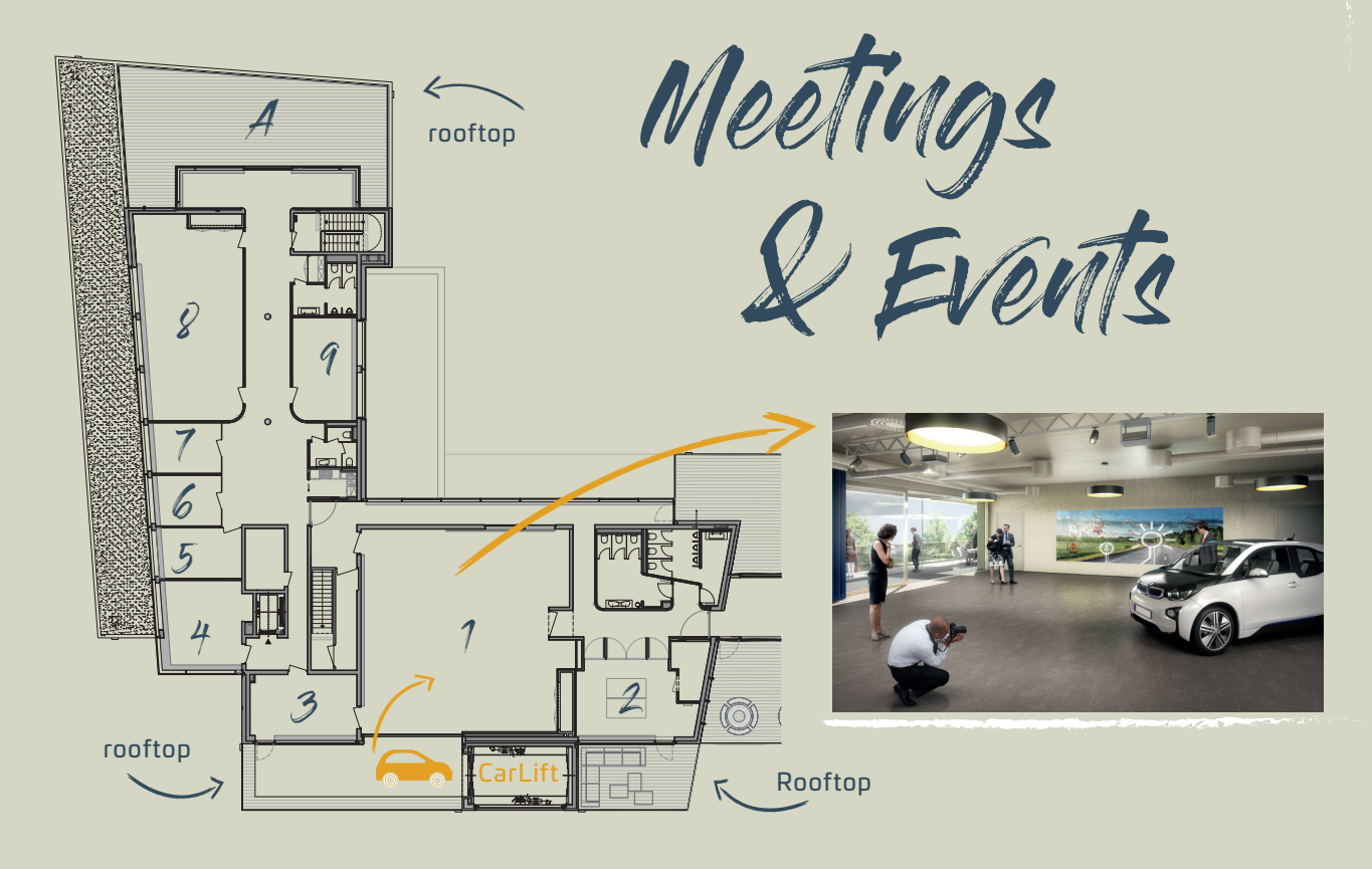
CarLift: width: 2.50 m | height: 2.20 m | depth: 5.57 m | ultimate load: 4 t